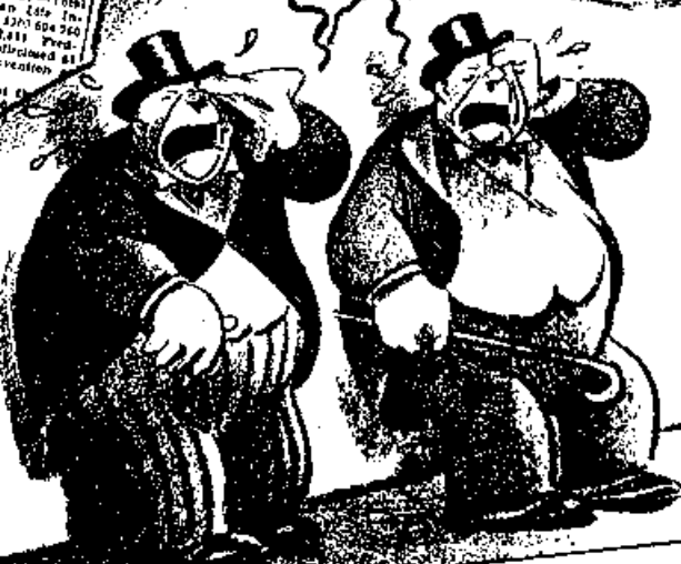
A cartoon published in a US newspaper in 1936.